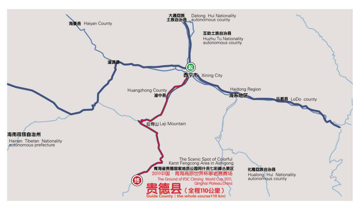
西宁至2011中国·青海高原世界杯攀岩赛场地路线图 The Road Map from Xining to the ground of IFSC Climing World Cup 2011, Qinghal Plateau, China